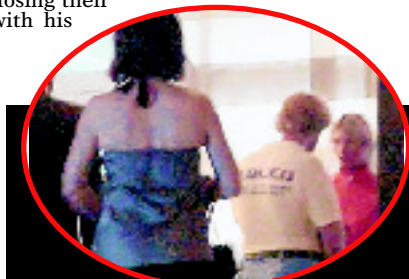
VENUE: At course

Monaco attracts the richest of the rich, who while away their days being pampered or who shop at the countless Gucci, Valentino and Armani haut couture stores that dot its cobbled streets.