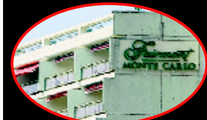
LUXURY: Monte Carlo's Fairmont Hotel