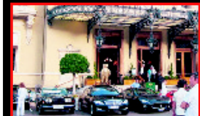
HOT SPOT: The casino in Monte Carlo